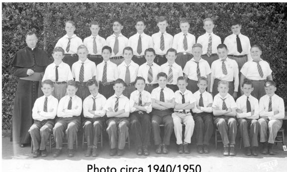
Photo circa 1940/1950.

Mission Dolores School for boys opens in San Francisco. The Christian Brothers teach the upper grades and the Sisters were given permission to teach the lower grades. The Brothers left in 1924 and the Sisters remained to teach all grades.