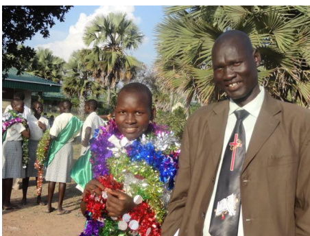
A proud father with his graduating daughter