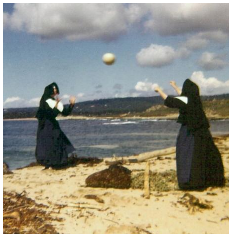
Sisters play volleyball on the beach at Carmel, circa 1960