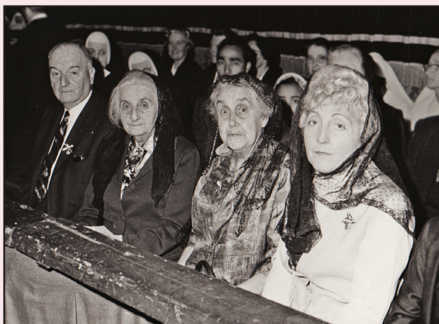
St. Julie Billiard's relatives at the canonization ceremony.

O n June 22, 1969, Julie Billiard was canonized by Pope Paul VI at St. Peter's Basilica in Rome.