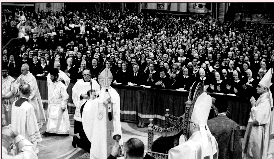
The canonization was witnessed by 800 Sisters of Notre Dame, including many from the Coesfeld and Amersfoort Sisters, who honor St. Julie as their foundress.