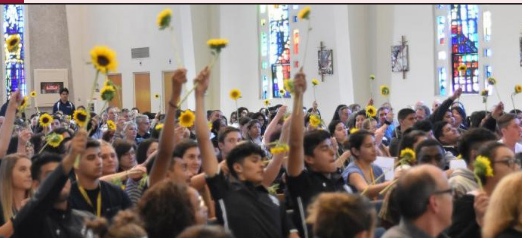
Notre Dame de Namur University students celebrate the anniversary of St. Julie's canonization.