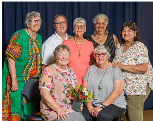
Sisters and friends from San Jose and Los Angeles add to the occasion.