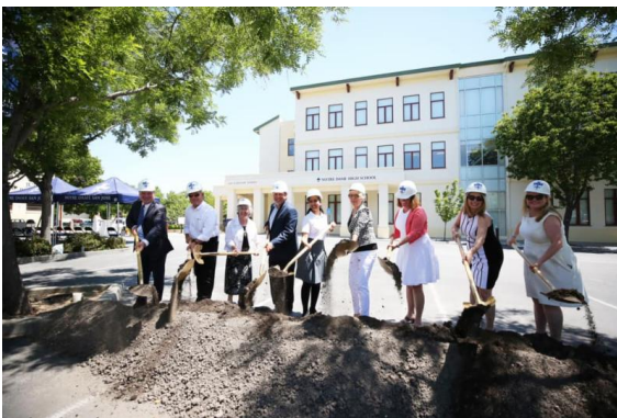
Dignitaries, Board Members and others breaking ground for the new Center for Women's Leadership at NDSJ.

Click here to see more reflections from Sisters of Notre Dame volunteering at the border.