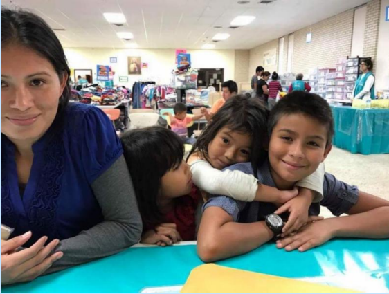
Above: A mother and her three children at the Humanitarian Respite Center in McAllen, TX.