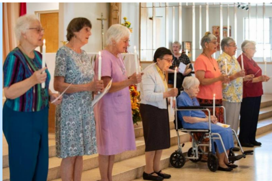
Jubilarians renew their vows as Sisters of Notre Dame de Namur.